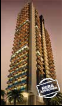
UK SANGFROID Andheri (West) ReraNo. P51800007085