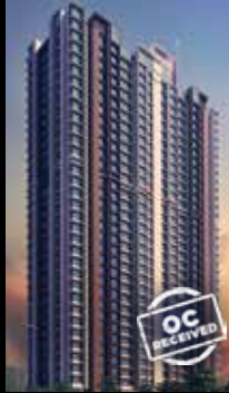
ANANTA Goregaon (East)