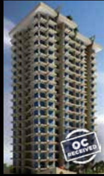
UK VEDIC HEIGHTS Kandivali (East)