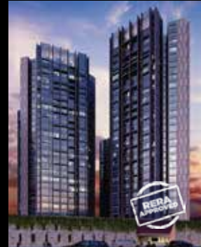
BOULEVARD Andheri (East) ReraNo. P51800002133 (Tower 4) P51800001690 (Tower 5)