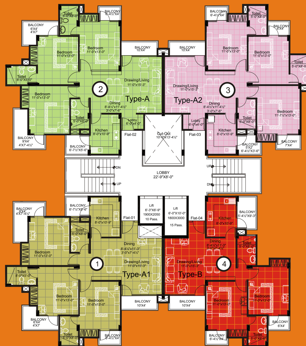
typical floor plan for blocks A, B, C, F, I & L (G. Floor to 9th Floor)